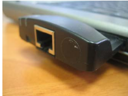
Picture 2: A laptop add-on Network Interface Card using the PCMCIA slot.